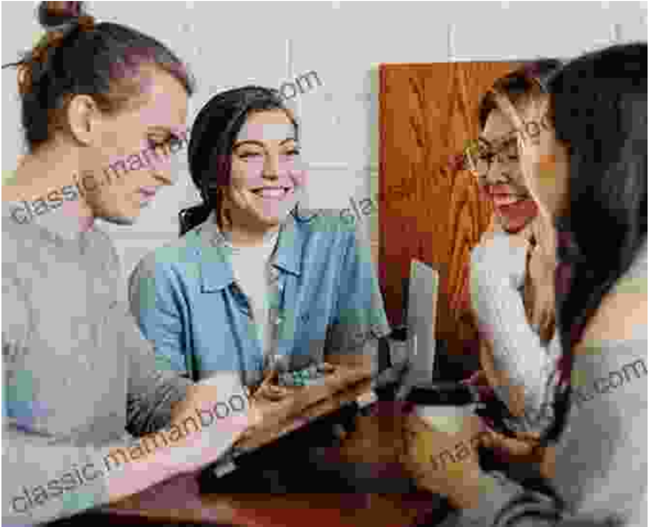
A Suggestopedic language learning class in session, utilizing music, art, and relaxation techniques